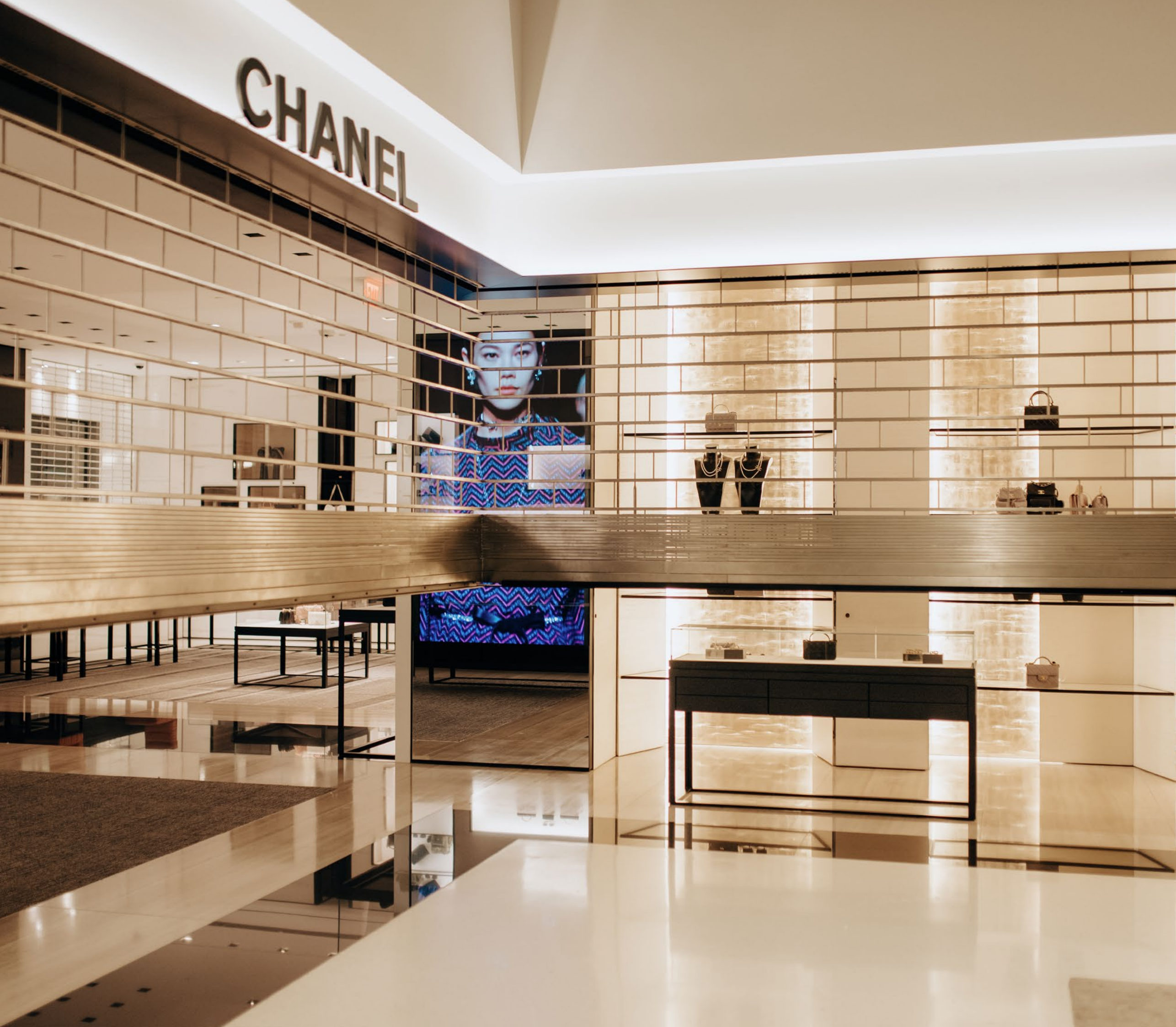
Bespoke Corner Stackdoor system with each straight side entrance spanning 6m.