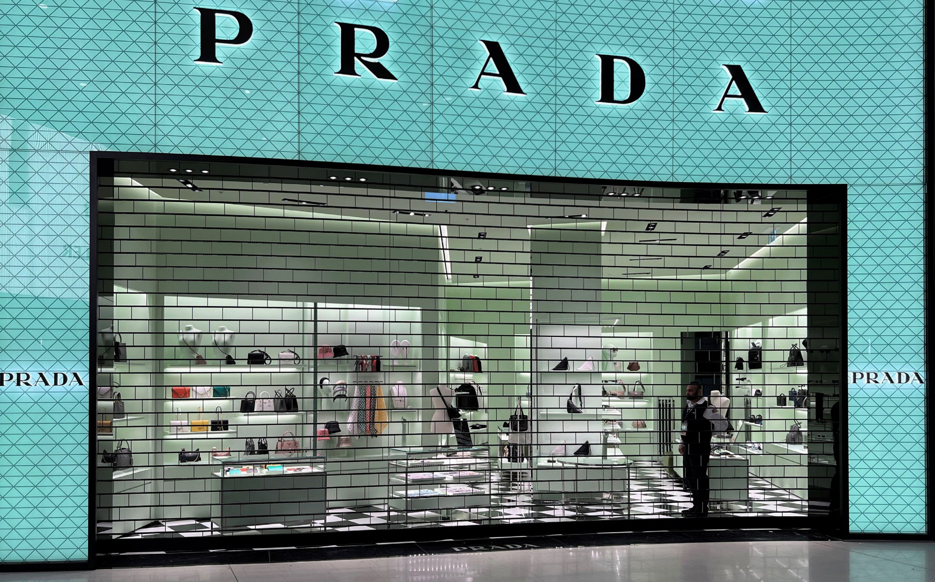
The Stackdoor Curve follows the gentle 'S' shape of the architecture.